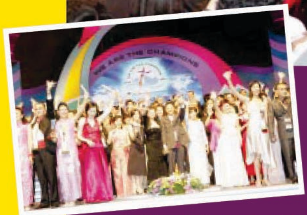
Nu Skin's top distributors are awarded on stage at the AsiaWorld-Arena.