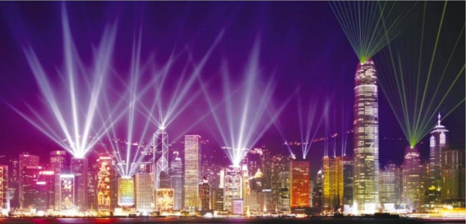
The spectacular "A Symphony of Lights" is the world's largest permanent light and sound show.