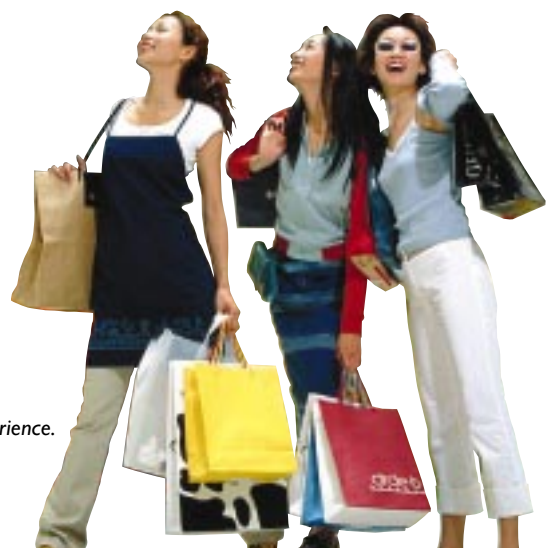
Shopping in Hong Kong is a fun-filled experience.

Motivation is a key word at a corporate event such as this. The company's purpose is to bring together people from different countries, create a family feeling of belonging and encourage the distributors to improve their sales – and thus their personal income. "We Are The Champions" is the slogan for this